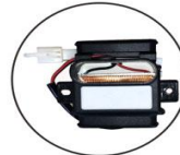
Semiconductor refrigeration module x4