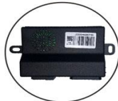
Control box X2