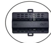
Fan driver X4