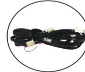
Wire harness X2