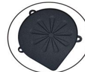
Muffling box X2