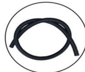
Exhaust pipe X2