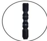
Ventilation pipe X3