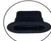
Air outlet pipe x4