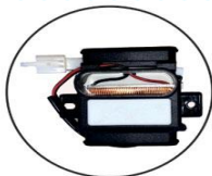
Semiconductor refrigeration module x4