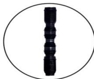
Ventilation pipe X3