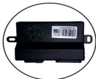
Control box X2