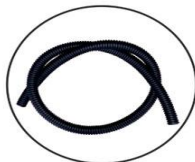
Exhaust pipe X2