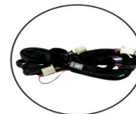
Wire harness X2