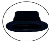
Air outlet pipe x4